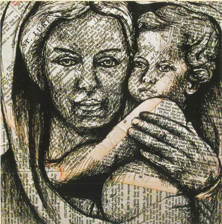
According to Luke - Rhonda Chase