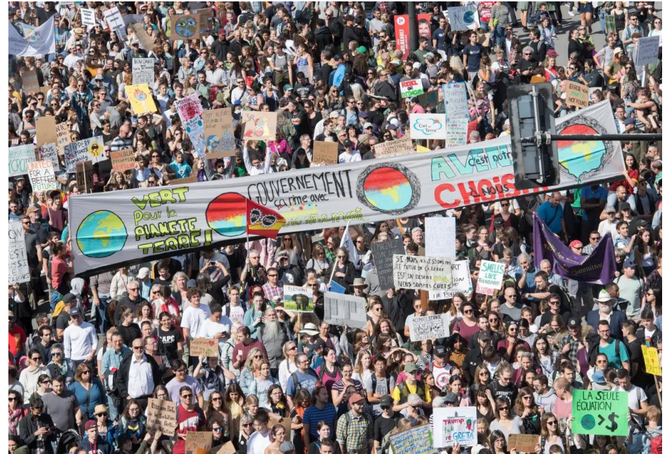
Montreal Climate Protest

Drop Box: We collect food for the pantries at St. Monica's and Women on the Rise. We also collect children's items (especially diapers) for Head and Hands .