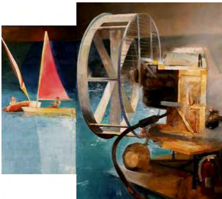
Wind Blows Wherever - Phil Irish