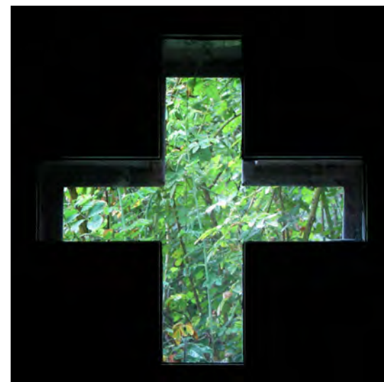
Jewish Museum, Berlin - Rombeek

♪ Hymn: Speak, Lord, in the Stillness.....pg 9 (442) www.youtube.com/watch?v=l_iuddgnw-c (piano only)