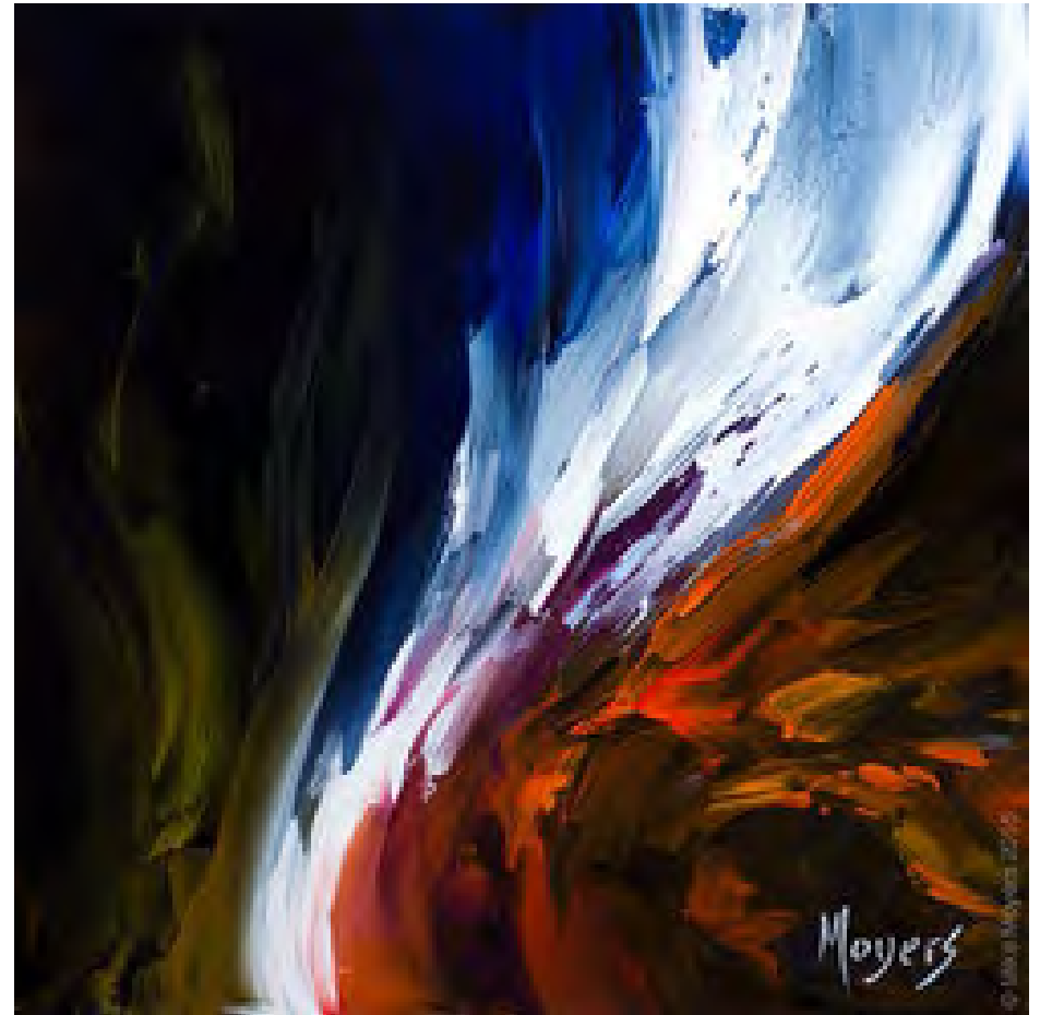
Prayer of Confession - M Moyers