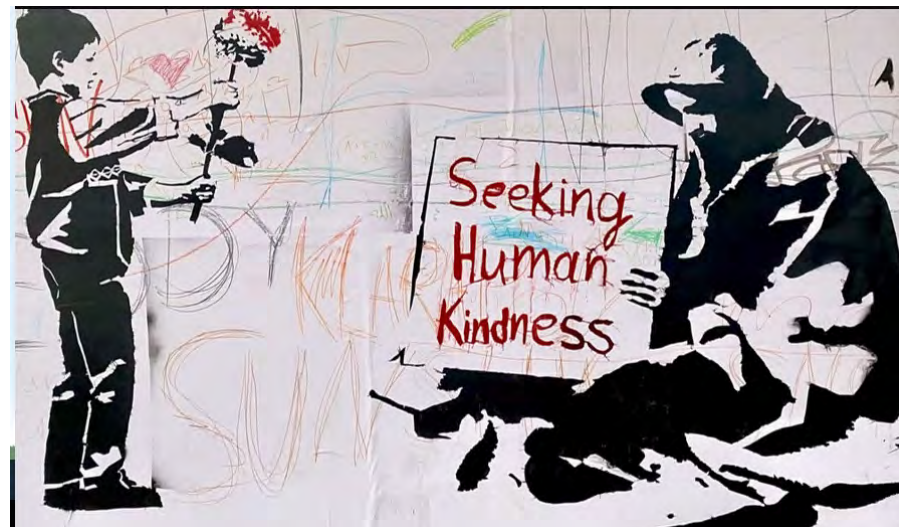
seeking human kindness