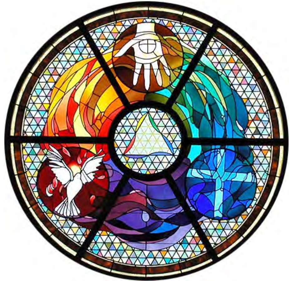
Trinity Window - Avondale PA