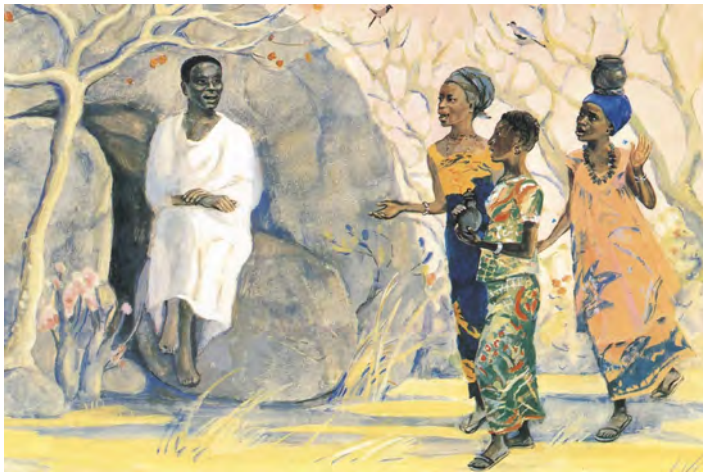
Empty Tomb - Jesus MAFA

It's the women who go, and the bright men (ie. people who had been in the presence of God) talk with them like they had been learning from Jesus in Galilee. They may not be mentioned much, but they were there. They listened. and now... they understand. The Greek word used for "remembered his words" also implies they understood them. This shows that what Jesus said was trustworthy, and it's important to pay attention to what is said. For us now, this means reading the Bible and talking about what is said.