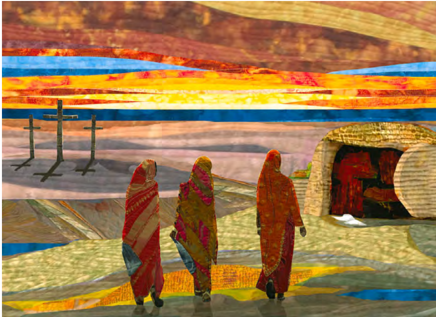
The stone rolled away - Michael Torevell

(Narrator should move away from the tomb to distract the audience while a stage hand moves the rock away from the opening of the tomb, and moves the "body" out, leaving a sheet folded up in its place.)