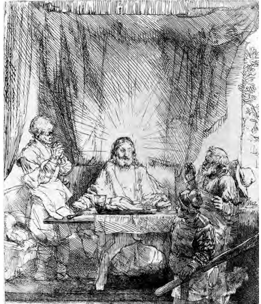
Supper at Emmaus - Rembrandt 1654

Words: public domain Music: public domain