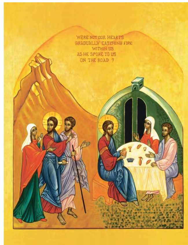
Supper at Emmaus - Marie-Paul Farran

Mailing a cheque or signing up for Pre-Authorized Remittance ( PAR ) are also good options.