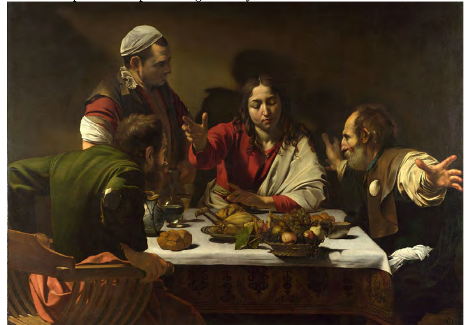
Supper at Emmaus - Caravaggio

Dear Jesus, thank you that you love each of us, and help us to keep learning about you. Amen.