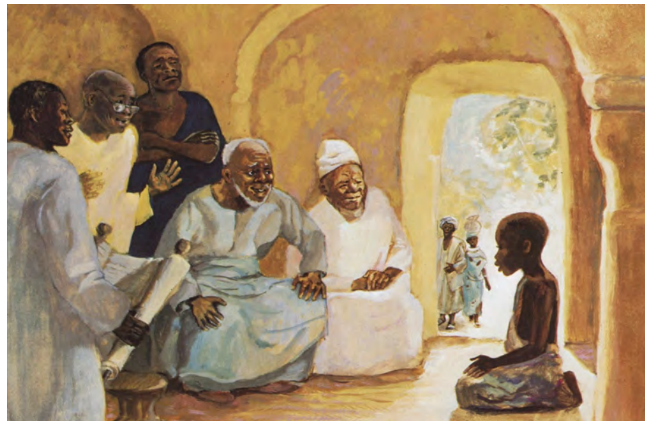
Jesus among the teachers - Jesus Mafa