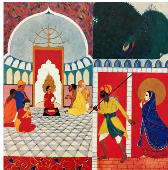
Boy Jesus in the Temple - Frank Wesley