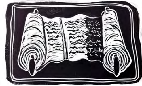
Reading from the Torah - Cara Hochhalter

Just before we hear the next section, we need to remember that books were invented a little after Jesus’ time. Instead they used scrolls, which are long pieces of paper that are rolled up to carry. Jesus is going to read from the prophet Isaiah. This was in his Bible - and is in ours too.