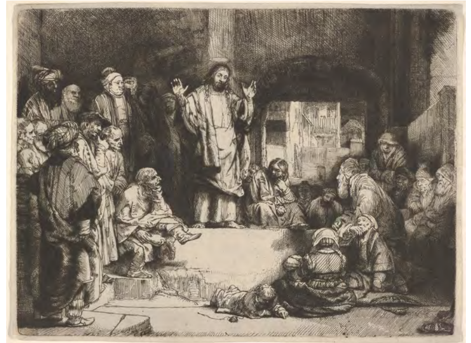
Christ Teaching - Rembrandt

Jesus reminds them of God's promise to bring good gifts to those who need them. He doesn't give the details of how this will happen, but he does say that he will lead the way. By listening and following Jesus, all these good gifts will become real.