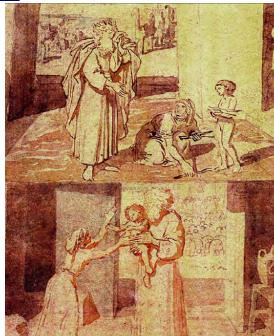
Elijah and Widow - A Ivanov