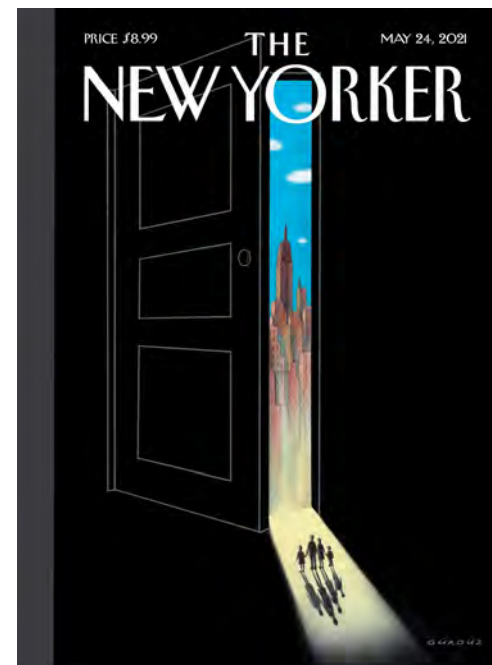
New Yorker 2021-05-24