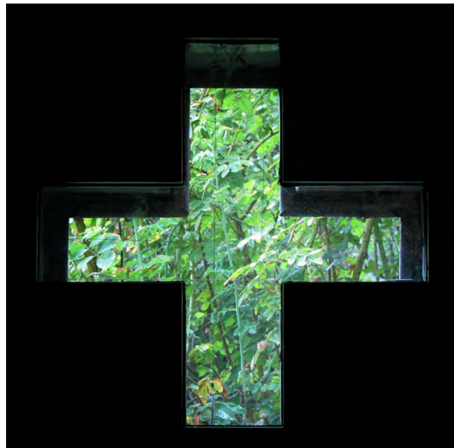
window in Jewish Museum, Berlin

Words: public domain Music: public domain