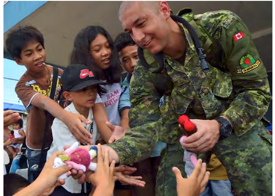
handing out Izzy Dolls