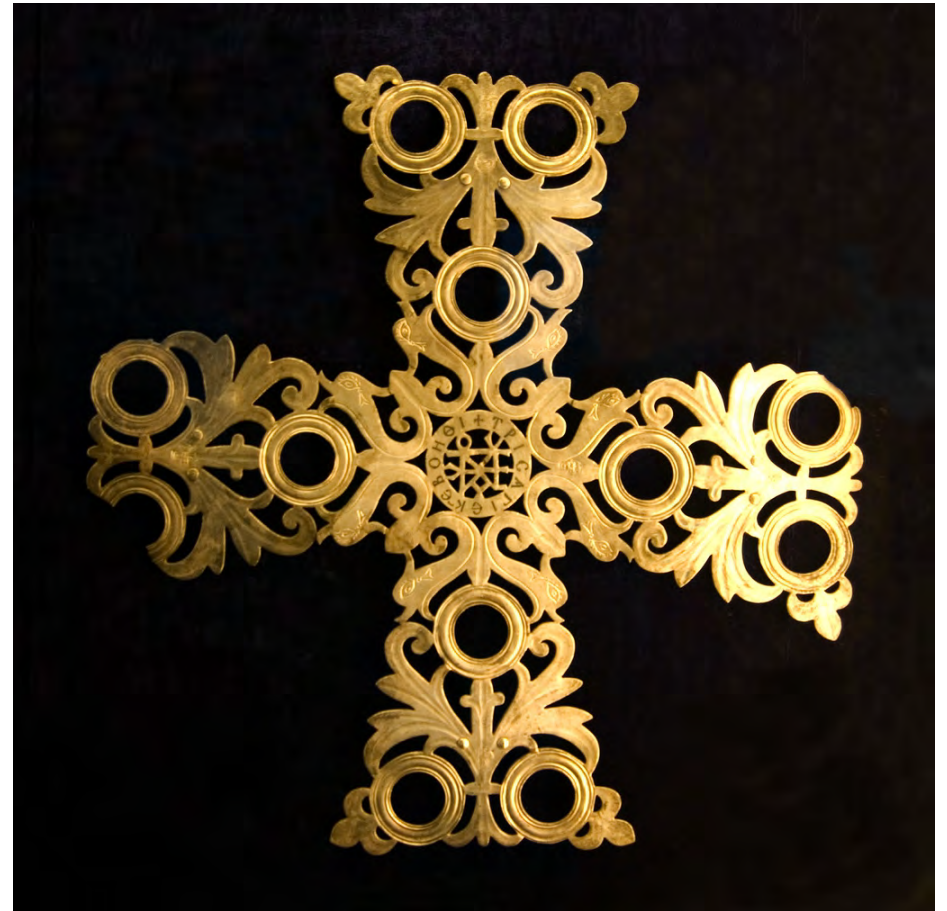
Golden Cross - from Turkey