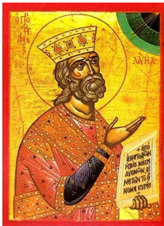
David the King - Hellenic Art

David is enjoying the stability and comfort of having his own home (palace). He assumes God would appreciate the same thing. Plus, it seems more appropriate that God would live in a palace/temple than in a tent. Even nice tents aren't that impressive. What could be wrong with these good intentions? 3