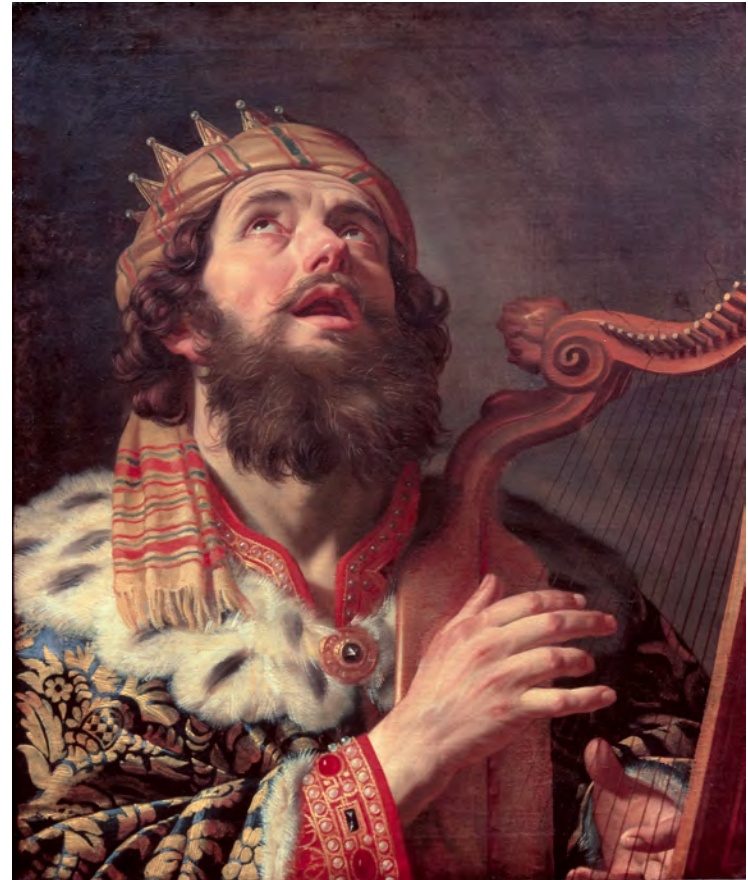
King David playing the harp - Gerrit van Honthorst