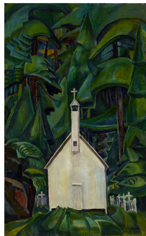
Church in Yuquot (Indian Church) - Emily Carr

♪ Hymn: I am the church.....pg 10 (475) www.youtube.com/watch?v=50kEqdXz3ao