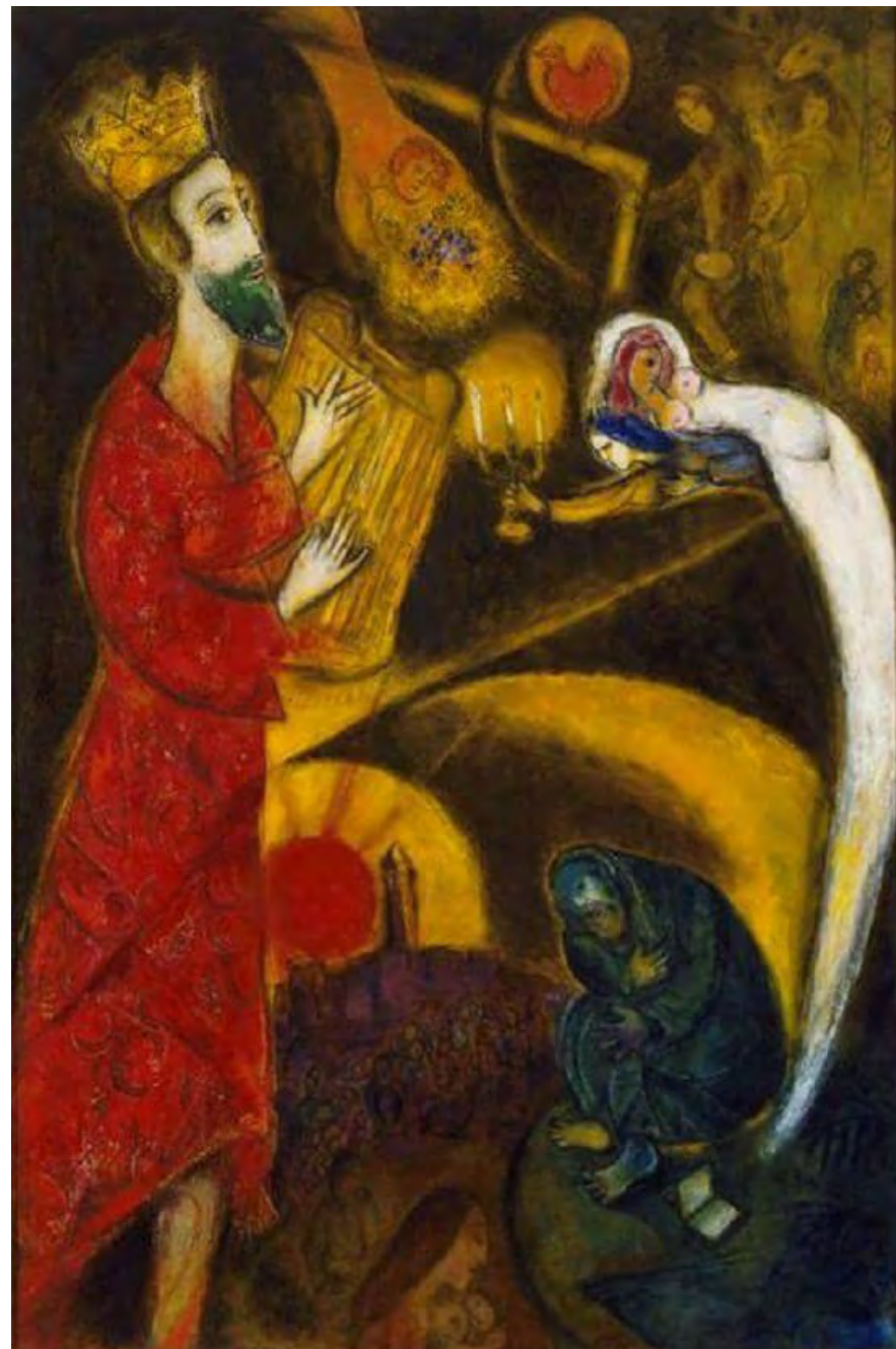
King David - Marc Chagall