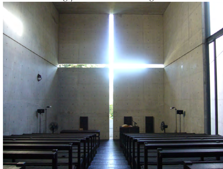
Church of Light cross - Ibaraki Kasugaoka