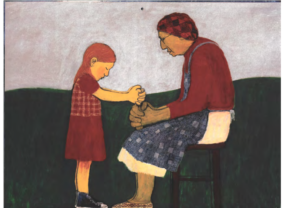
Grandmother and I - Gunnarsdóttir

Help us to be open to your Spirit, to shape us as we pray the prayer you teach your disciples: