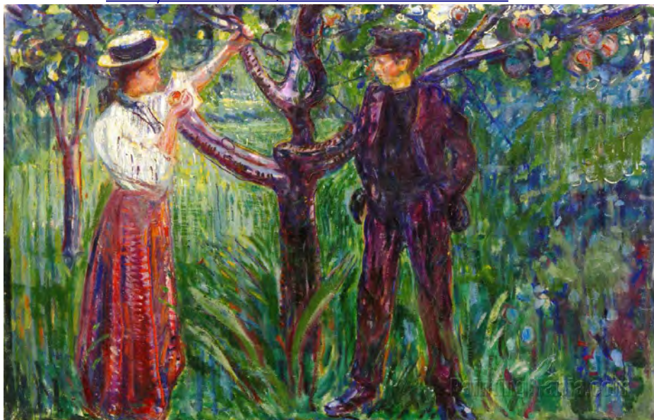
Adam & Eve 1909 - Edvard Munch