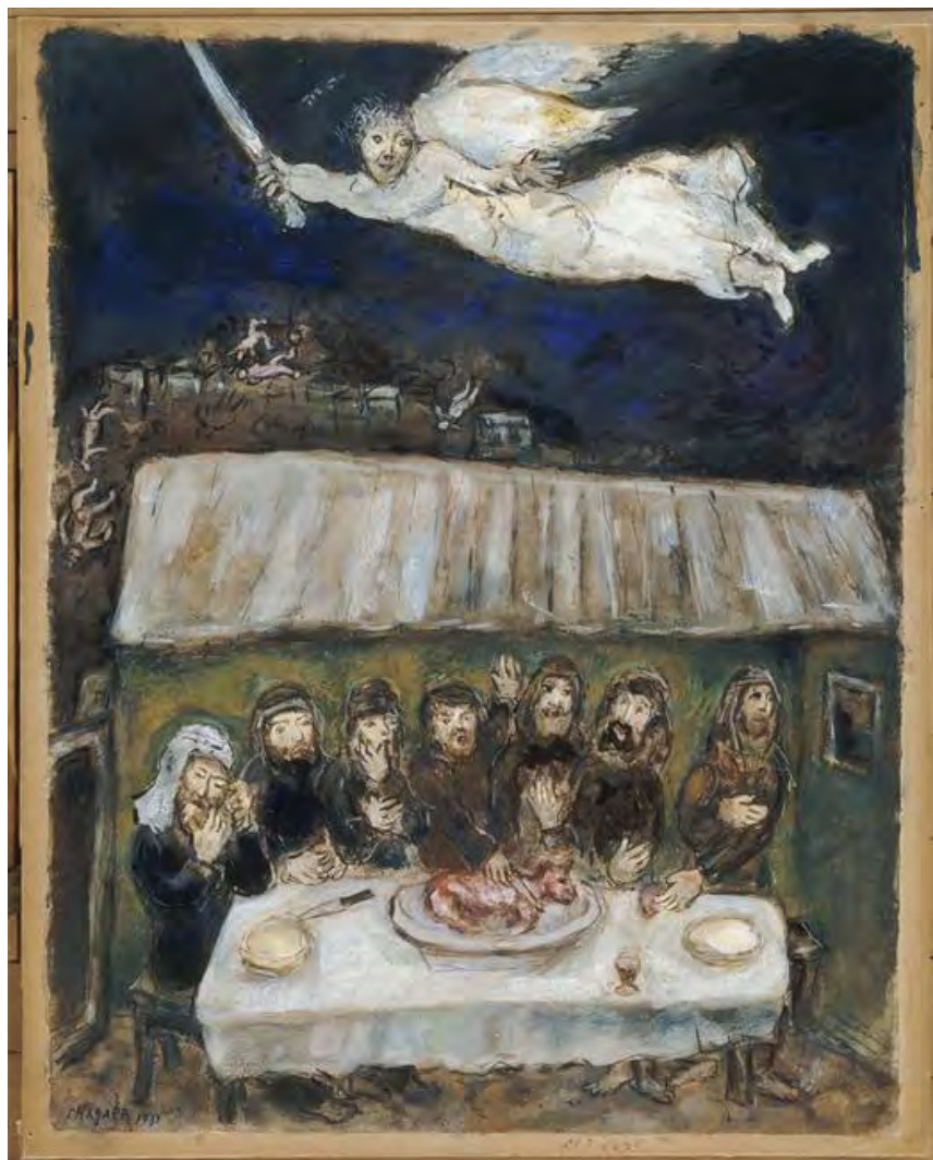
The Israelites are eating the Passover Lamb - Marc Chagall

choices? Will we face similar consequences?