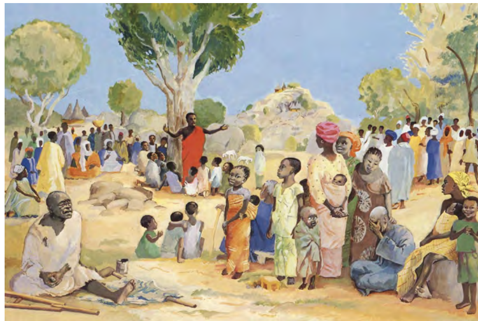
Sermon on the mount - Jesus MAFA

Psalm 139 : 1-14 (although it's all good)