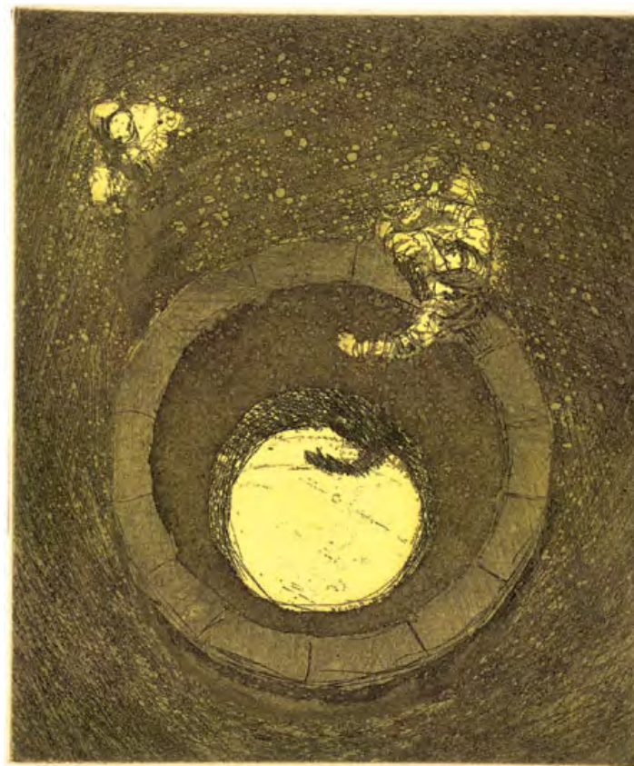
Sermon on the mount - Jesus MAFA

Baptism is a visible sign of the invisible gift of the Holy Spirit.