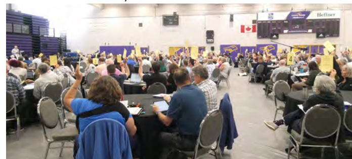
General Assembly 2024