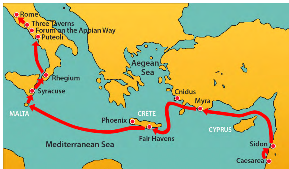
Paul's Cruise to Rome

Now, whenever you hear one of these places, please say the line.