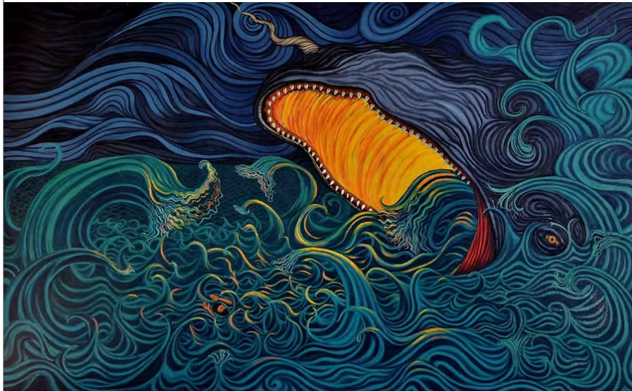
Jonah and the cave of the earth - Baumgartner

18-20 Next day, out on the high seas again and badly damaged now by the storm , we dumped the cargo overboard.