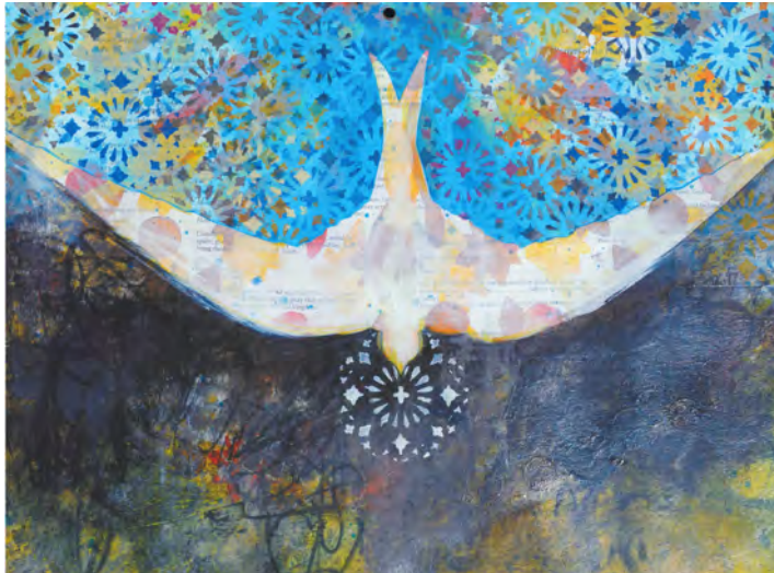
Beloved - Carolyn C Brown

Once, we were safely ashore, we found out this island was Malta . (We're not there yet).