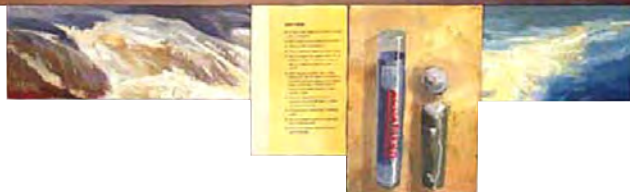
Aquamen - Phil Irish