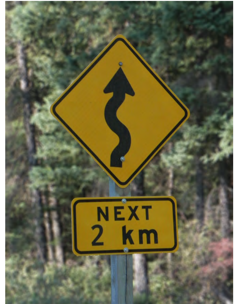
Road Ahead - Rombeek