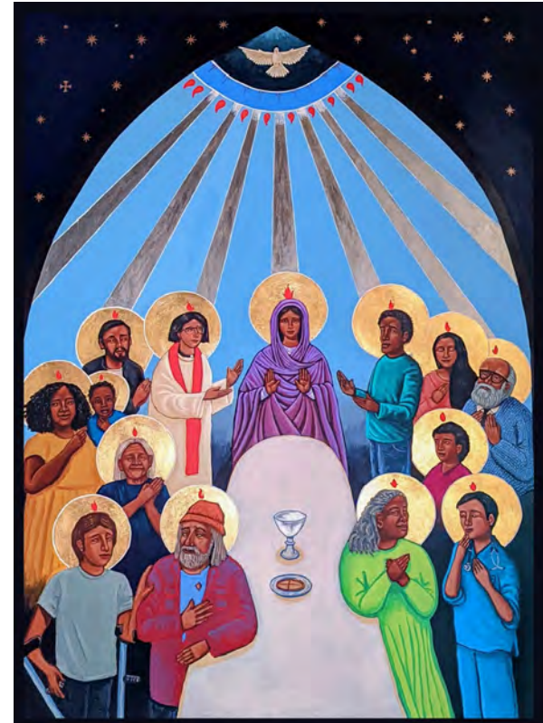
Pentecost Kelly Latimore

New Hope Walk: 9:30 - 12:30 walk & lunch