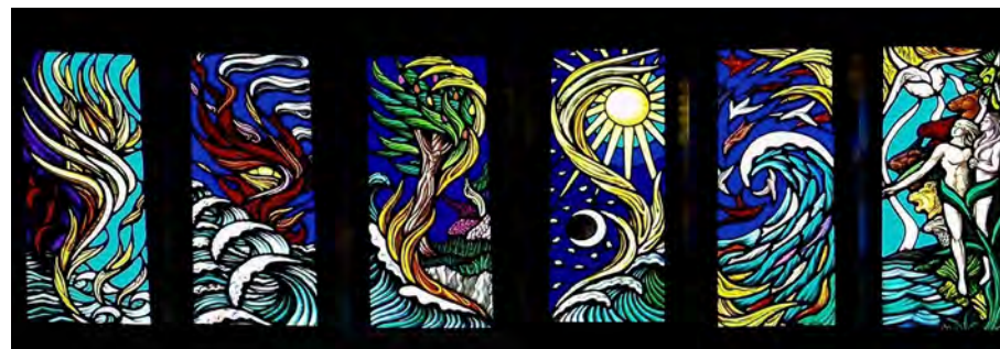
Creation Window - Sacred Heart RC church Bilton, Warwickshire

would have sung at church. It's about creation. Listen for what is mentioned, and what it's like when God's Spirit is around. How does the singer want to respond to God?