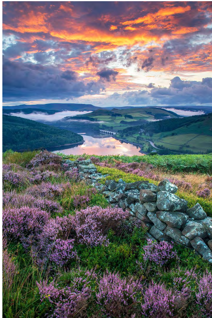
Bamford Beauty - Lee Howdle