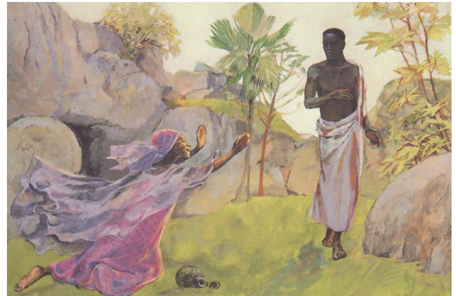
Christ Appears to Mary - Jesus MAFA

Praise to God for times when we see and are inspired by the Holy Spirit.