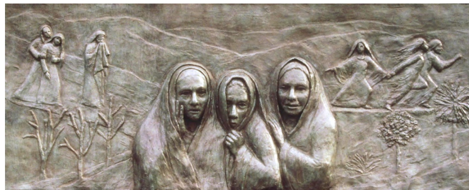
women at the tomb - Bryans