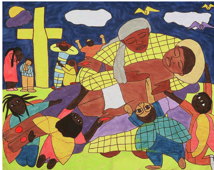
mother and son - brink