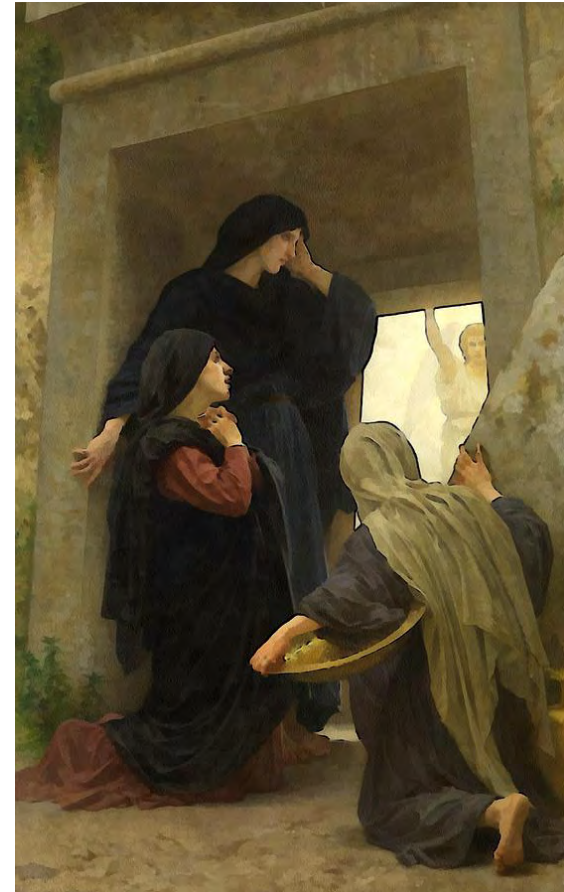
the holy women at the tomb - William Bouguereau

Lighting is impressive. I can watch it for hours. In those days, it was a sign of the gods. An angel, who looked like lighting, is more impressive. As usual, the angel starts by saying "Do not be afraid."