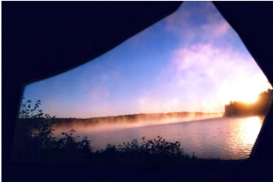
Thanksgiving in Algonquin - Rombeek