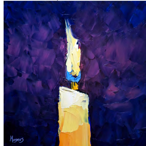
Shine - M Moyers