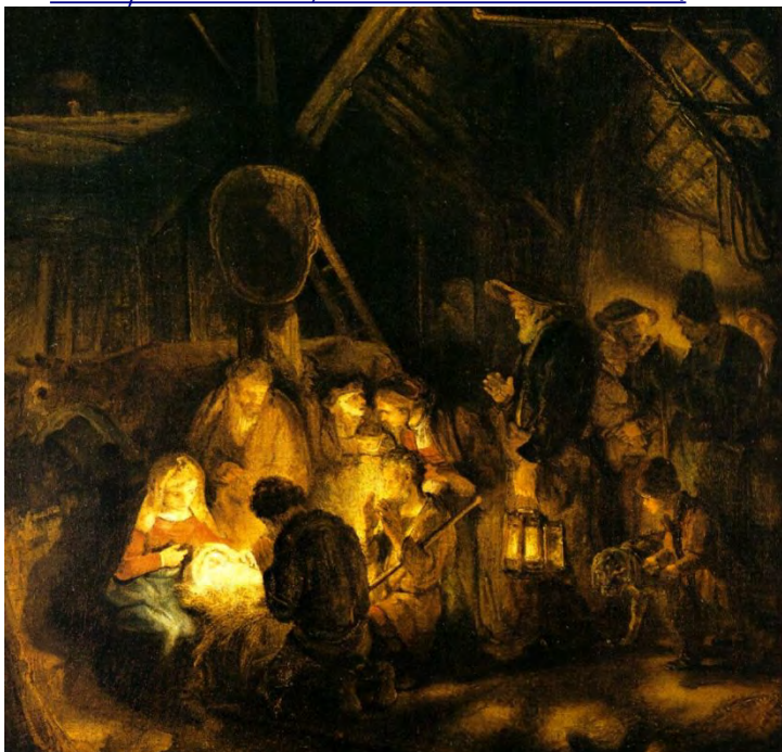
Nativity - Rembrandt