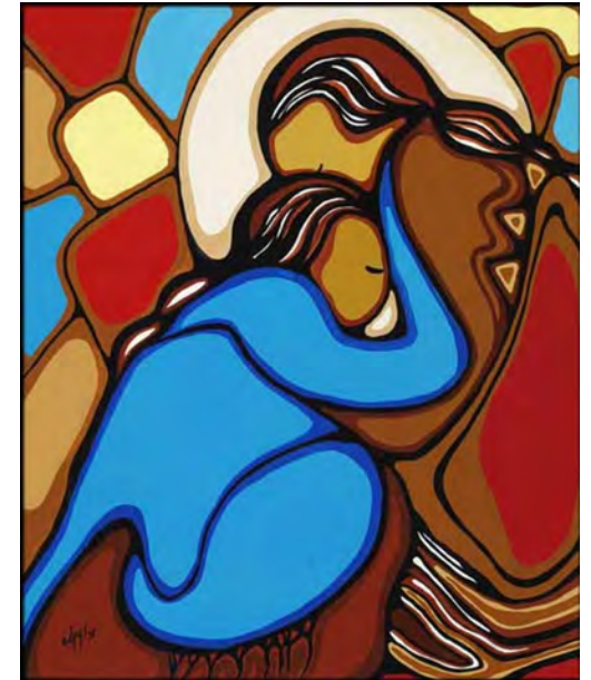
Comforting - Daphne Odjig