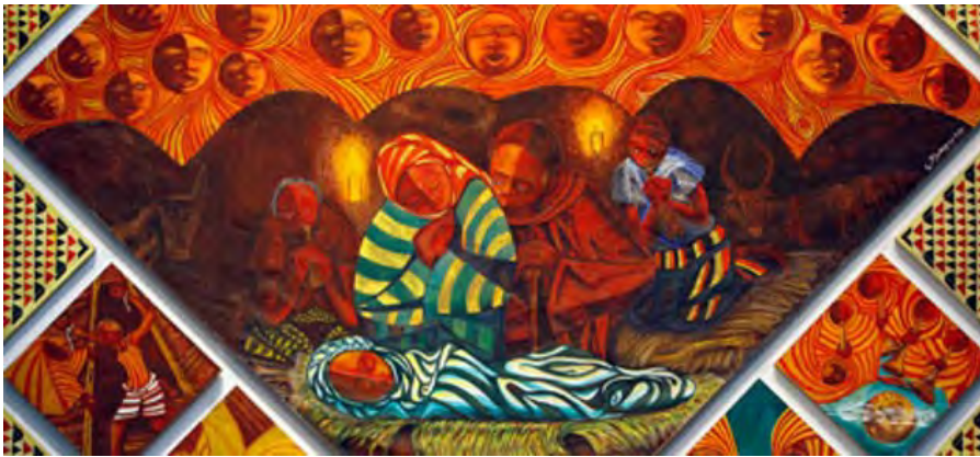
nativity - cameroon