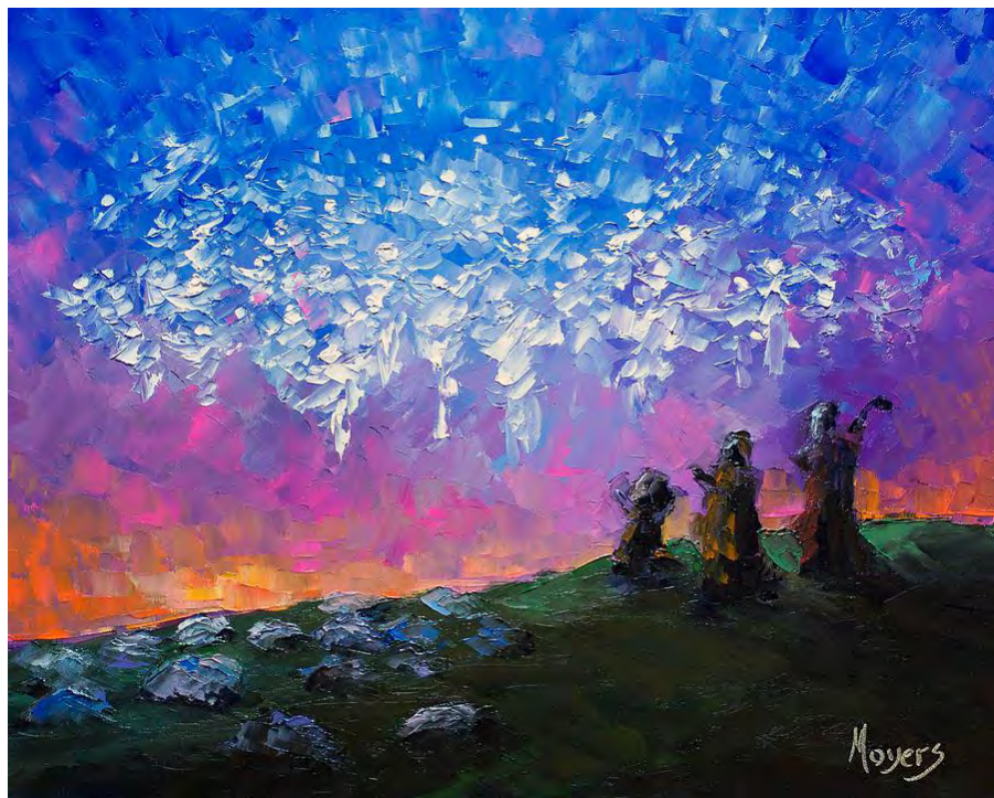
Heavenly Host - M Moyers