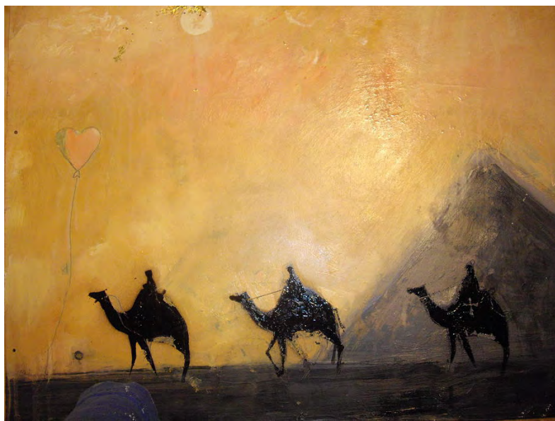
Wise Men - R Cunningham

After an appropriate time for meditating, move the figures one at a time until they form a circle around the door of Bethlehem. (You will place the figure at the opening later.) Unroll the white section of the scroll. Present the last card and say: