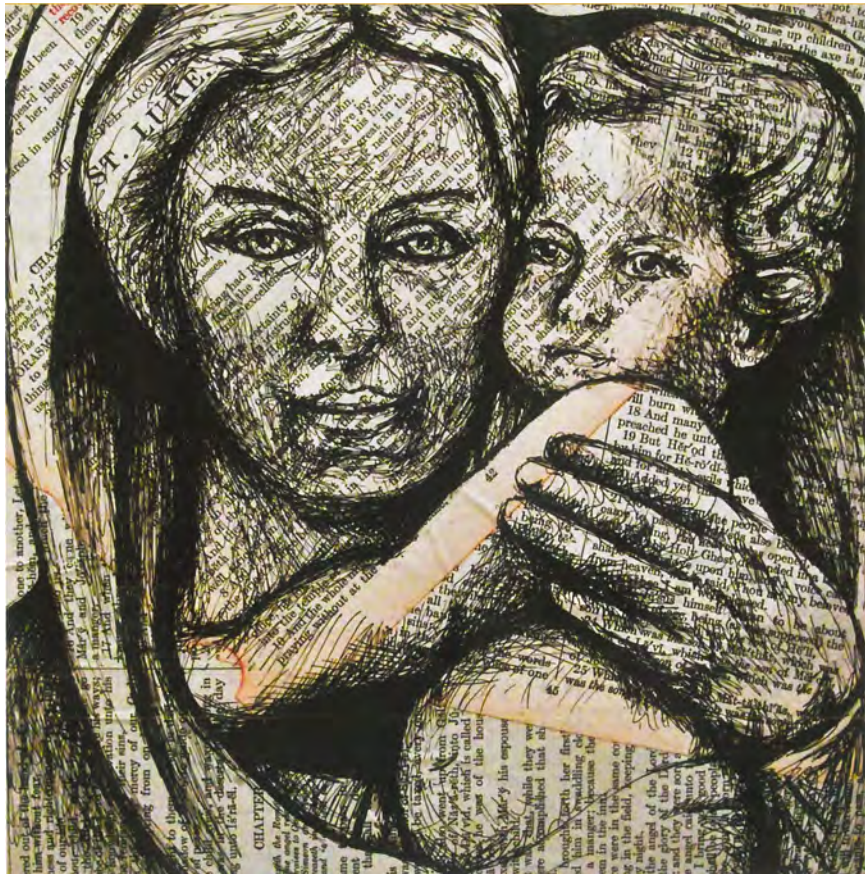
According to Luke - Rhonda Chase

Mailing a cheque or signing up for Pre-Authorized Remittance (PAR) are also good options.