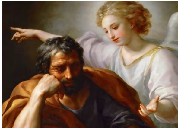
Dream of St Joseph - Mengs