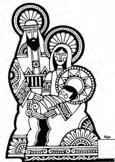
Holy Family - Ukraine