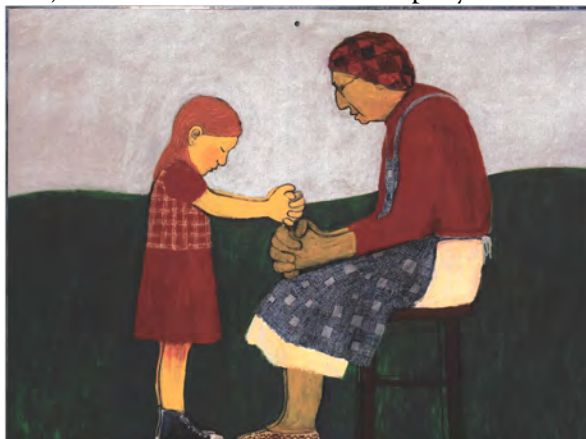
Grandmother and I - Gunnarsdóttir

But for now, let's listen in as someone prays the Lord's Prayer. 7