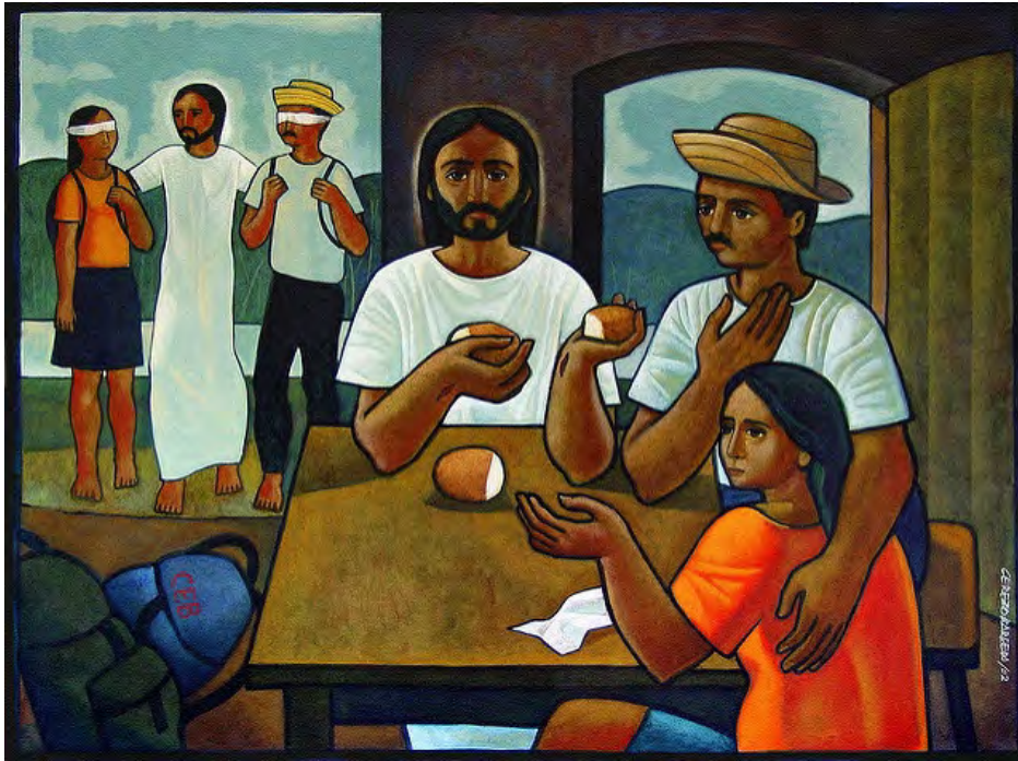
Supper at Emmaus - Barredo Maximino Cerezo