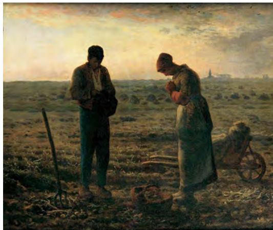
The Angelus - Millet

♪ Hymn: Take time to be holy.....pg 16 (638) https://www.youtube.com/watch?v=rFApbg-wcmE or https://www.youtube.com/watch?v=LexoOrUhBNc