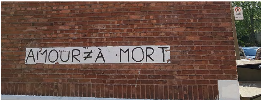
Graphitti on Kensington (north of Sherbrooke)