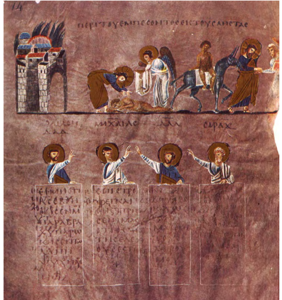
Good Samaritan c550 AD