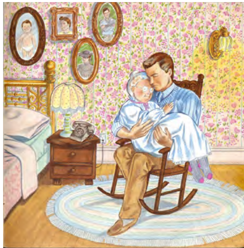
Love you forever Munsch & McGraw

Hear the good news, To all who turn from sin in sorrow, to all who turn to God in hope, this is God's Word of grace: We are accepted, we are forgiven, we are loved. This gift we have from God. Thanks be to God. Amen.