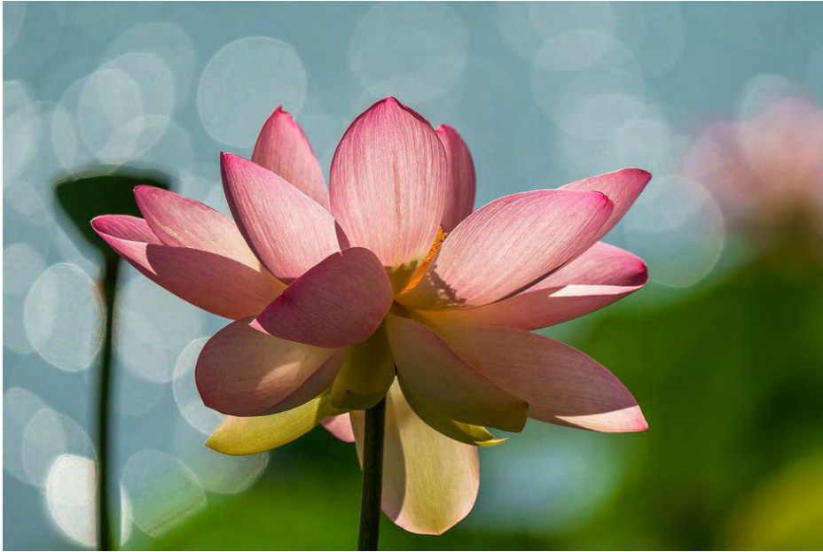
Controluce - Gianluca Benini

I think the first thing is that nature is amazing. The animals, birds, plants, and fish... even rocks are amazing. You can spend time with any of them and be amazed by so much.