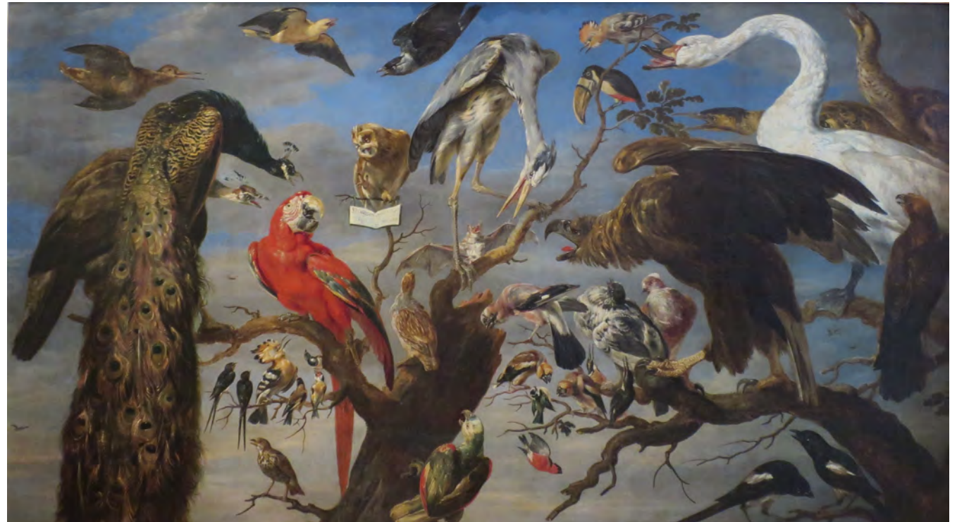
Controluce - Gianluca Benini

♪ Hymn: All creatures of our God and King.....pg 10 (433) youtu.be/WtT3SRnnGOI?t=50