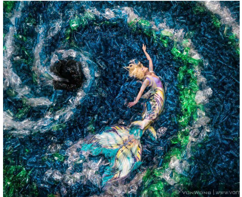
Mermaid surrounded by trash

and draw us into the wildness and wonder of your Holy Spirit today and every day. Amen.