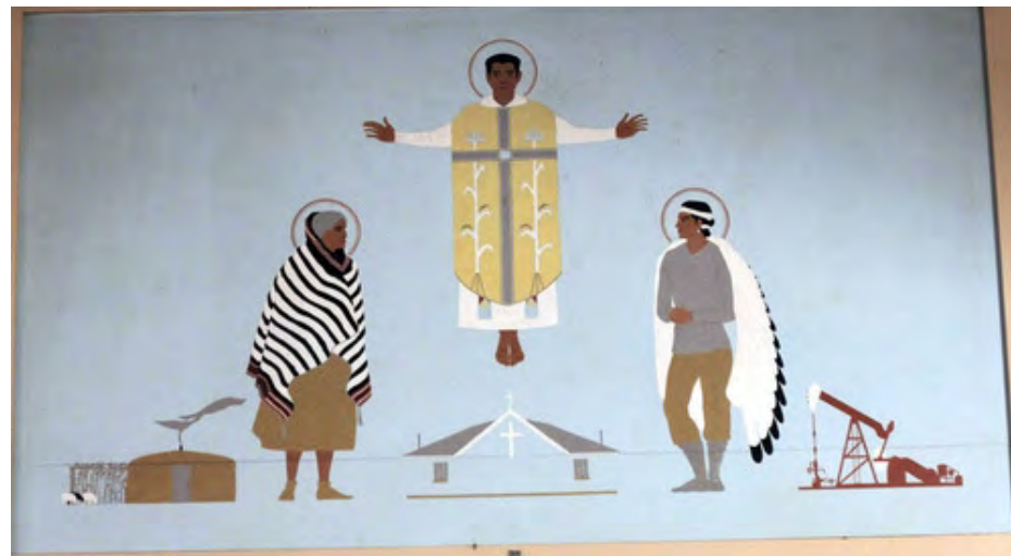
ascension - Navajo

Mailing a cheque or signing up for Pre-Authorized Remittance ( PAR ) are also good options.