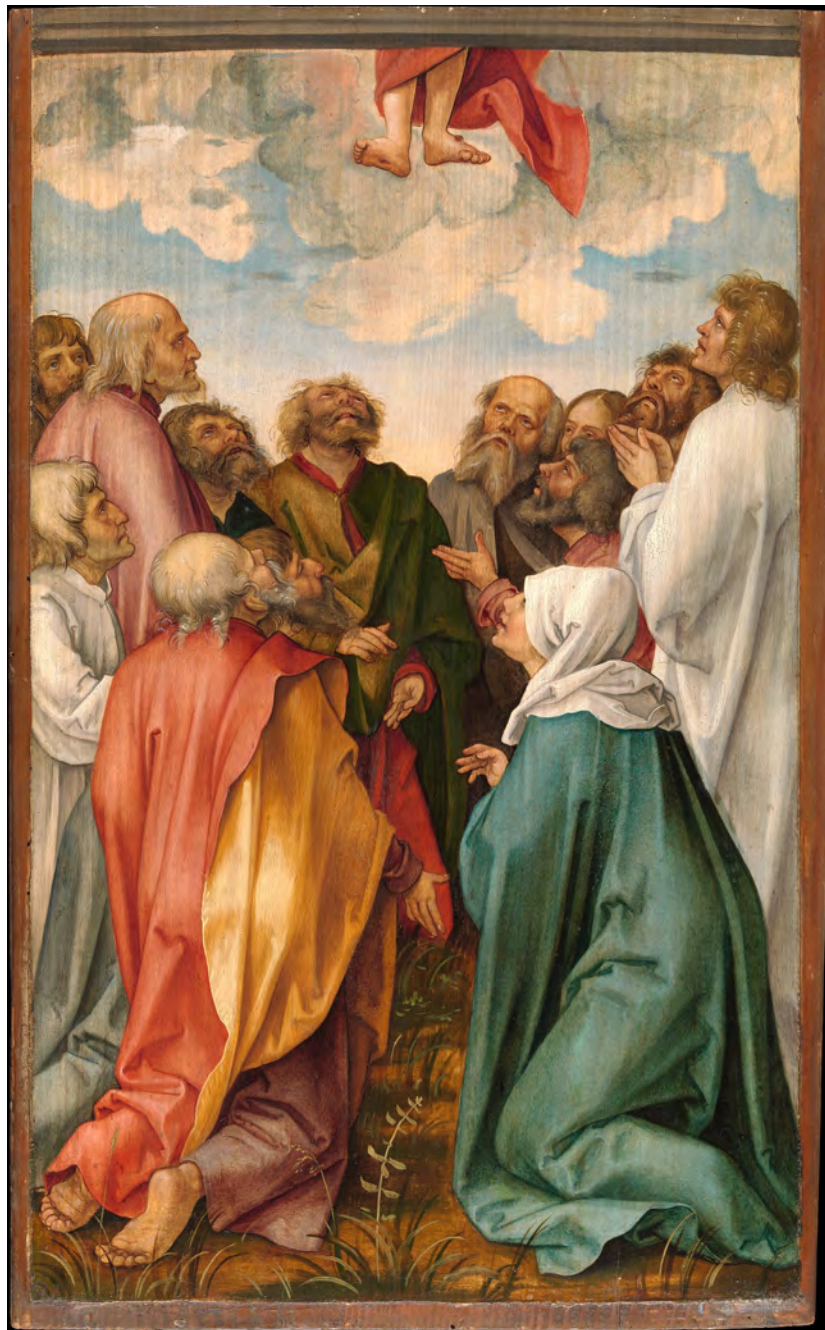
Ascension - von Kulmbach