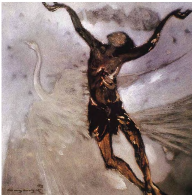
Ascension - Bagong Kussudiardja

Words: copyright © Maranatha! Music, 1980, 1983 Music: public domain