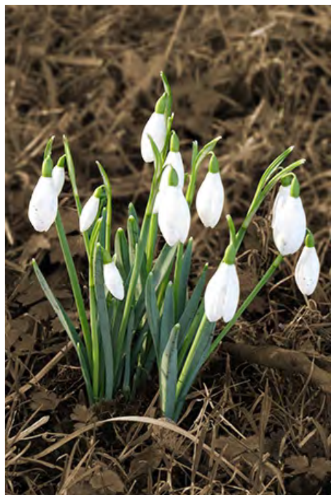
Snowdrops

Christ was even willing to give up his life for us.