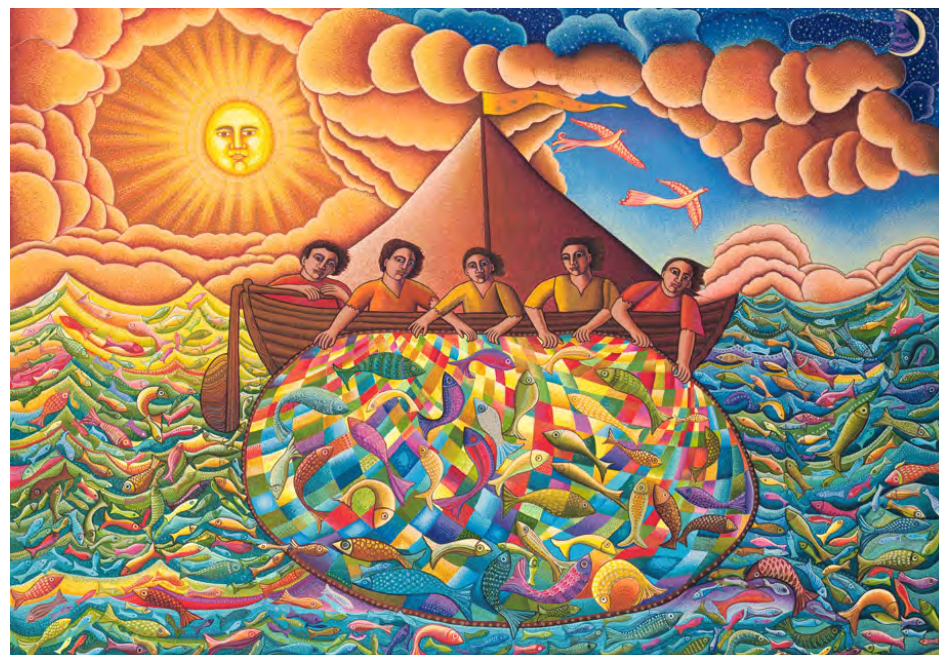
Great Catch - Swanson

Communion Hymn: Let us talents & tongues.....pg 13 (563 #1-2) www.youtube.com/watch?v=6P16lQrkbNU