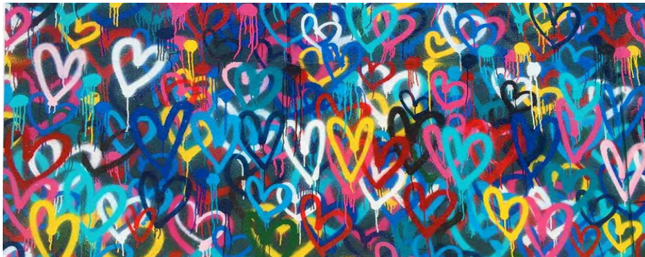
Love Hearts - Banksy

♪ Hymn: God is love.....pg 10 (314) www.youtube.com/watch?v=GFwnnIAjnAE