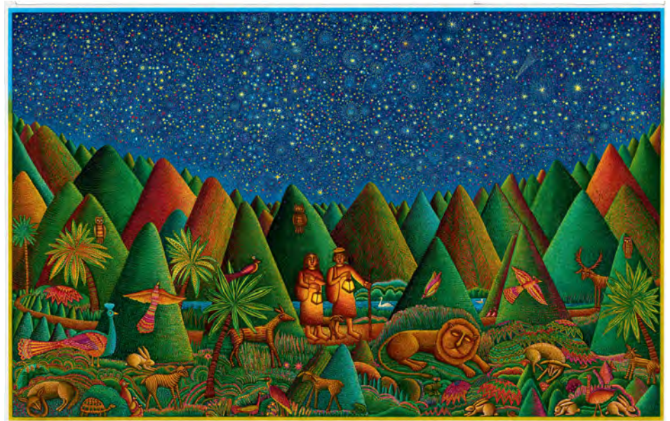
Psalm 23 - Swanson