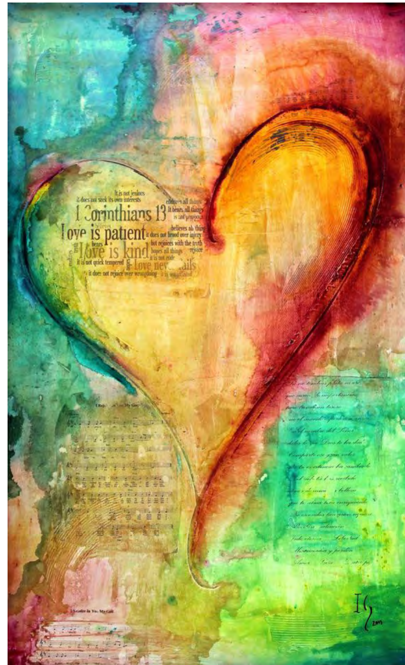
1 Corinthians 13 - Ivan Guaderrama

Words: copyright © 1969 by Hope Publishing Co. Music: adaptation, copyright © 1969 and this arrangement © 1982 by Hope Publishing Co.