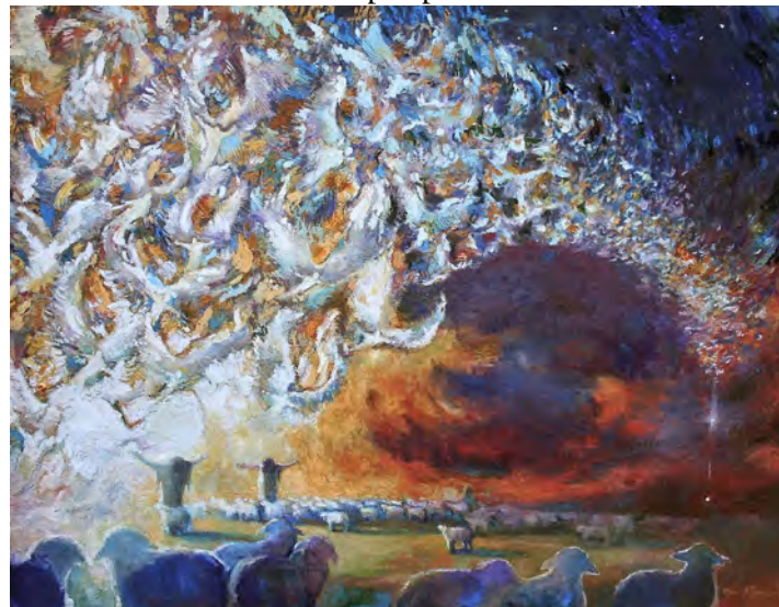
Shepherds - Seeing

Know these words from Matthew 1: 21 She will give birth to a son, and you are to give him the name Jesus, because he will save his people from their sins.