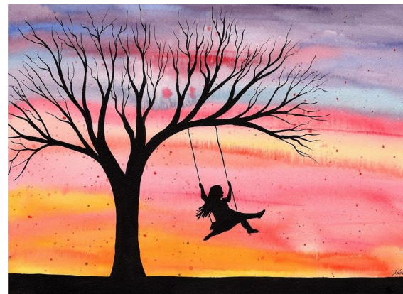
Sunset Joy klbailey

Words: English translation copyright © Mennonite World Conference, 1990 from International Songbook 1990; French translation, copyright © The Presbyterian Church in Canada, 1996 Music: public domain CCL No. 4440603