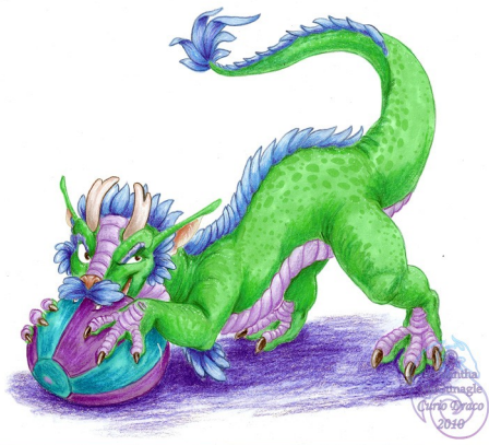
Playful Dragon - CurioDaco

So, teachers and psychologists will tell you it's important to play and experience joy. They can list all sorts of reasons for it like being adaptable, learning about yourself, building community, resetting your ideas, etc. etc.