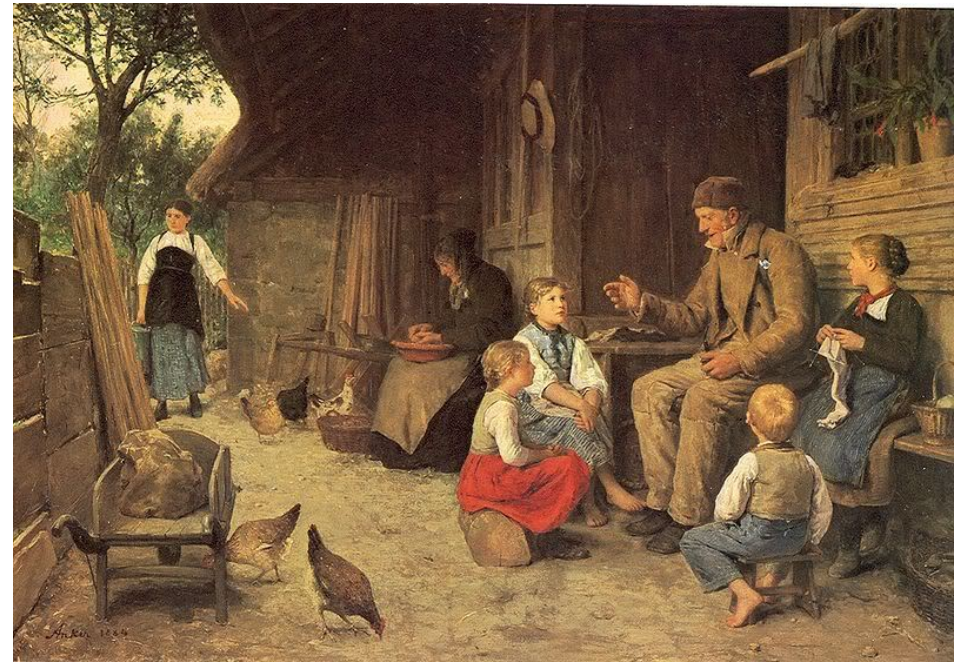
Grandfather tells a story - Albert Anker