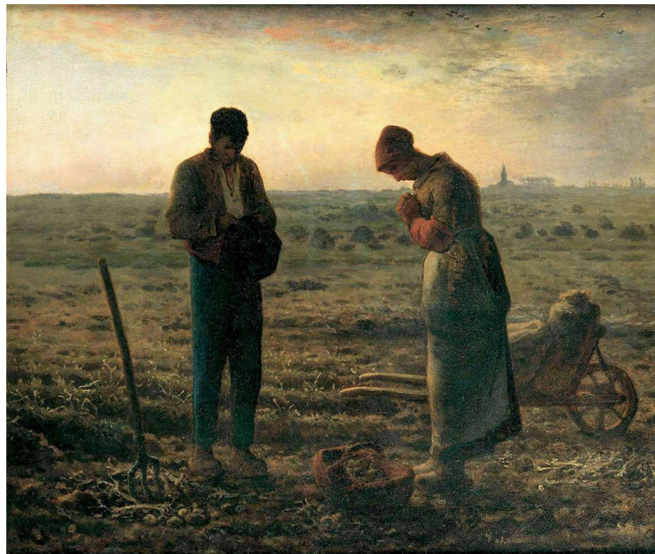
The Angelus - Millet

In the name of God the Creator, God the Son & God the Holy Spirit - three in One. Amen.