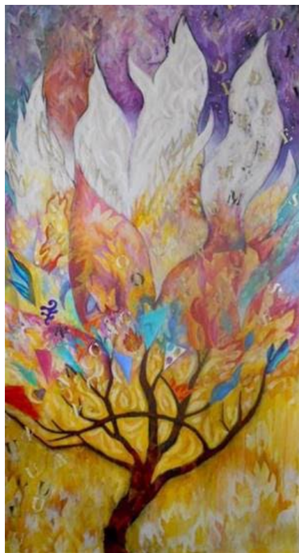
C Mattix - tree with lights in it

Which is actually how we 'get the good stuff'. It's not because we get God to do what we want; it's because we get that God knows what we should want.